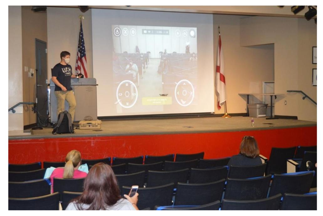
Figure 3. The first AUSOME demonstration with Space Camp for Educators tool place in June 2021 with limited capacity due to the COVID-19 global pandemic.

Several sources of donations provided the resiliency to hold out until Summer 2021 when the Space Camp for Educators returned with limited capacity and the inaugural AUSOME Demonstration could take place. AUSOME was the first exposure of "drones" not only to the Space Camp for Educators program but also to many of the teachers who went through the summer camp sessions between 2021 and 2022. Smaller scale workshops, guest lectures, and fly-days during the off-season in Fall, Winter, and Spring with the USSRC provided additional opportunities to showcase AUSOME, FAA educational outreach, and the field of UAS research.