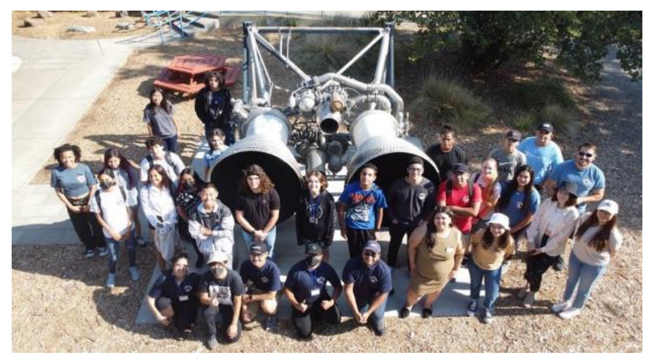
Figure 14. UCD 5th Summer ASSURE Drone Academy, July 27-30, 2022. Academy Students visit the NASA Gemini Rocket Engine in Davis, CA.