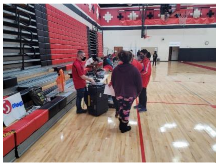
Figure 26. Middle School Students Learning About VTOL and Fixed-Wing UAS Designs and Applications.