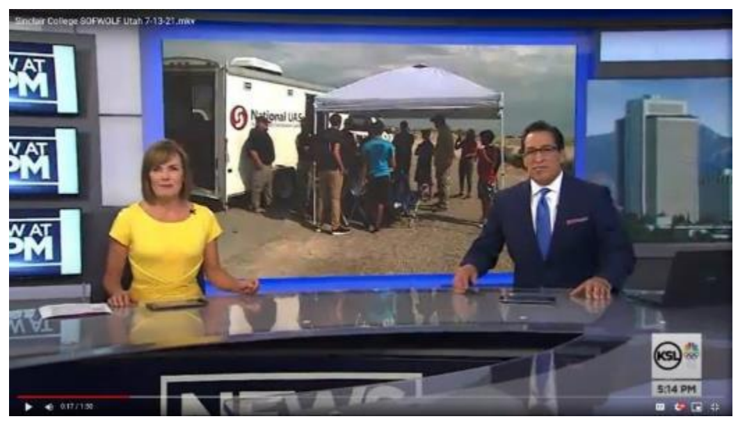
Figure 36. KSL Channel 5 SOFWOLF DRONE WOLF UAS Camp Story in Provo, Utah.