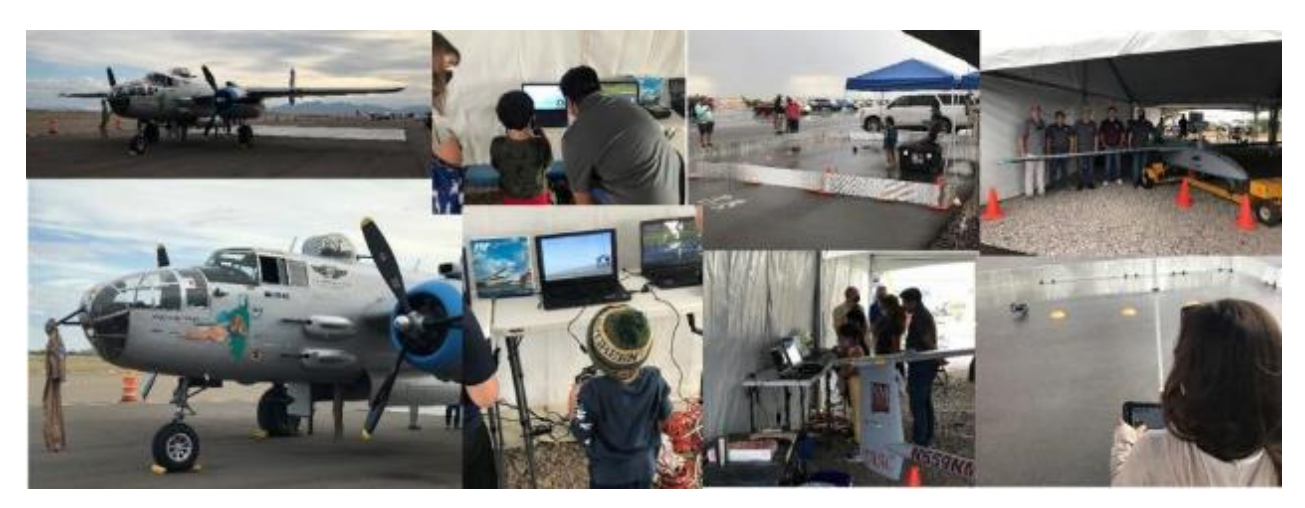
Figure 41. Wings 'n Wheels Fest '21 reached many students in the local Las Cruces area.

Near the end of 2021, a number of members of the STEM III team supported and worked with the FAA Communications Office's Jim Tice as he prepared the STEM article for the FAA.