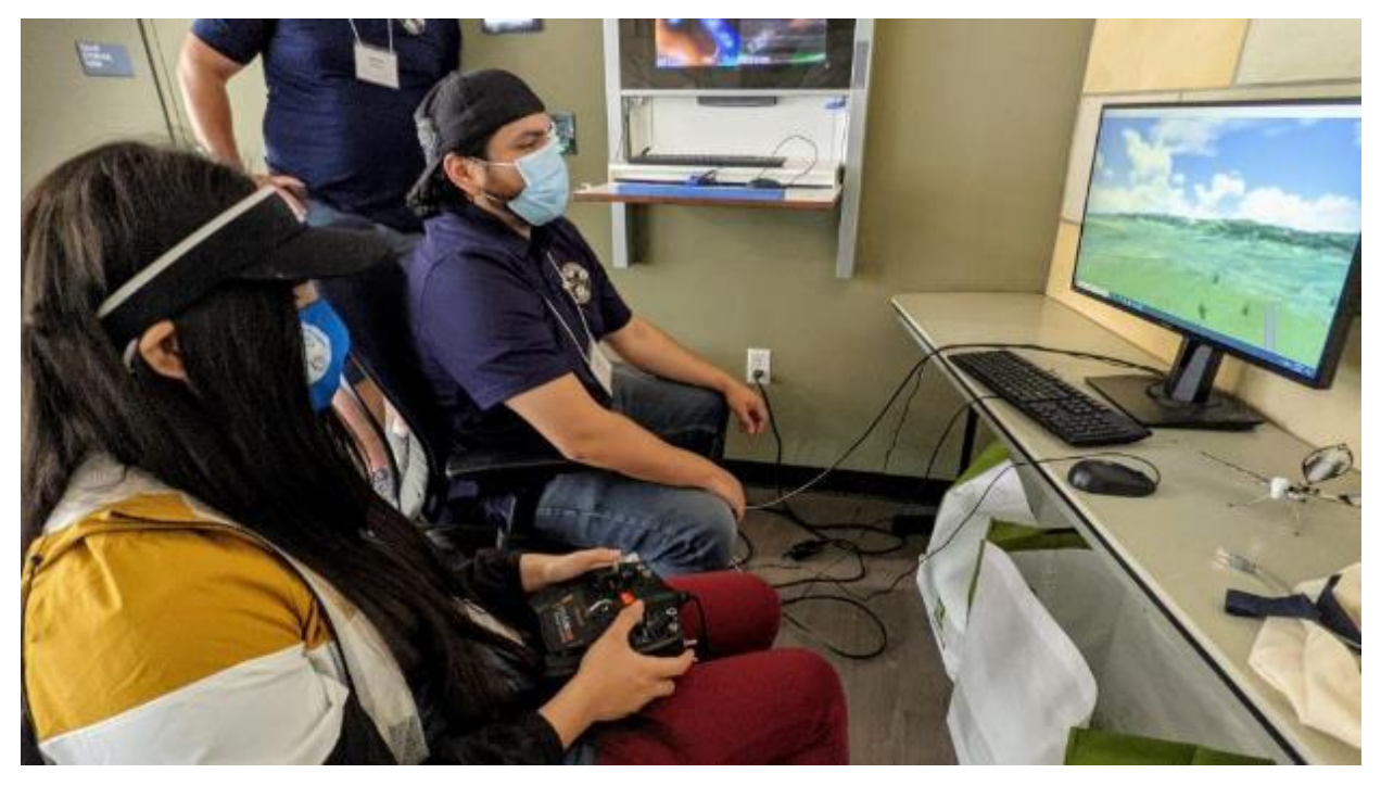
Figure 12. UCD Flight Simulator Training, February 2022.