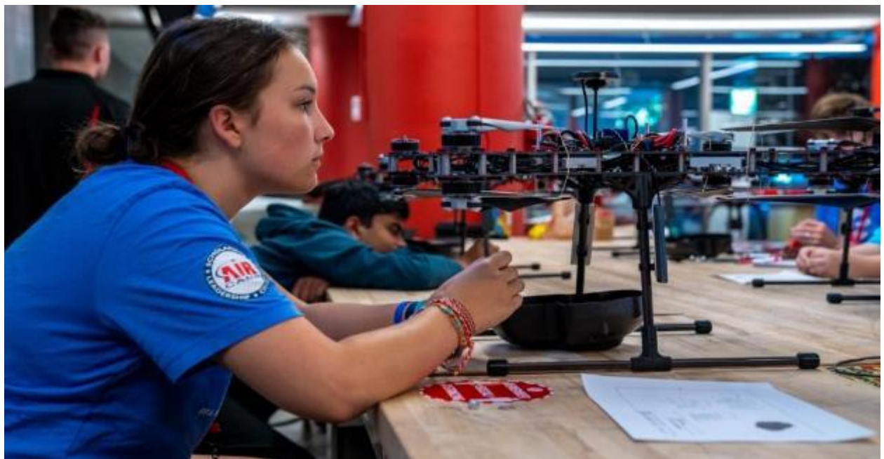
Figure 23. Air Camp High School Student Installing a Sensor Mount on a SelectTech EH-8 UAS.