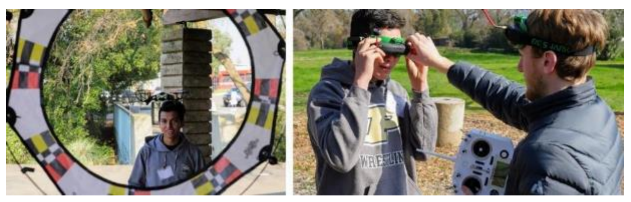
Figure 10. UCD April 2021 Preparation for Sumer Drone Academy.