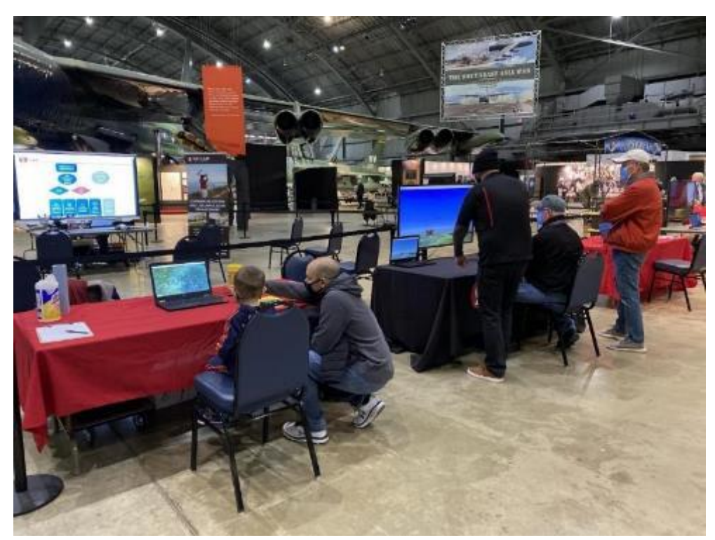
Figure 22. Project Presentation and RealFlight Simulation Stations at the National Museum of the United States Air Force.