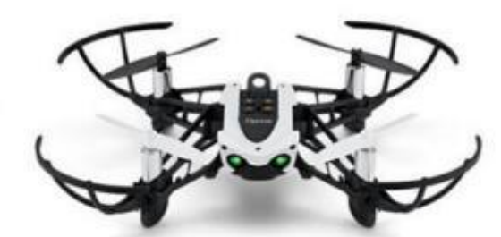
6. Flying, 7. Programming, and 8. Payload Challenge with Mini Drones