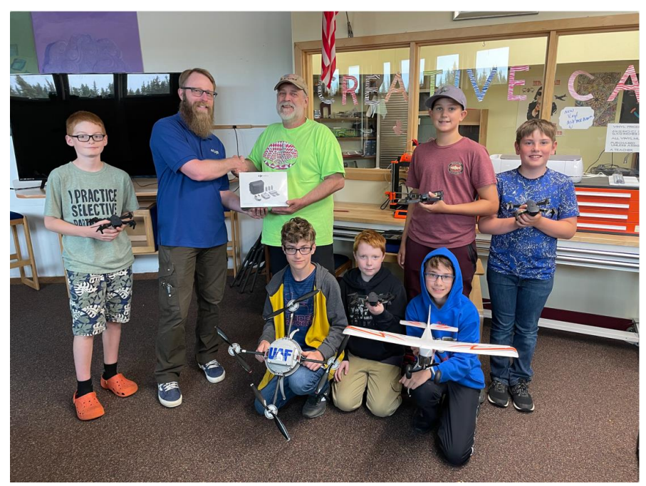
Figure 8. Students in the Delta Junction summer camp.

July 12, 2022 - The UAF team provided drone outreach as a part of the Delta Junction Summer School.