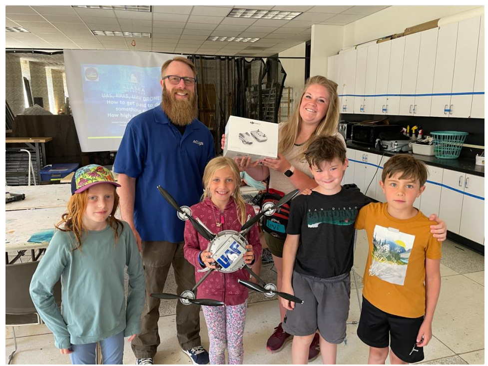
Figure 7. Some of the students at Camp Fire Alaska.

June 7-9. 14-17, and 20-22, 2022, UAF conducted drone STEM activities during three weeks of Camp Fire Alaska events at different locations on the Kenai Peninsula and in Anchorage. Camp Fire has the advantage of bringing kids from across Alaska together so the team can reach many more kids from remote locations than per our normal outreach event.