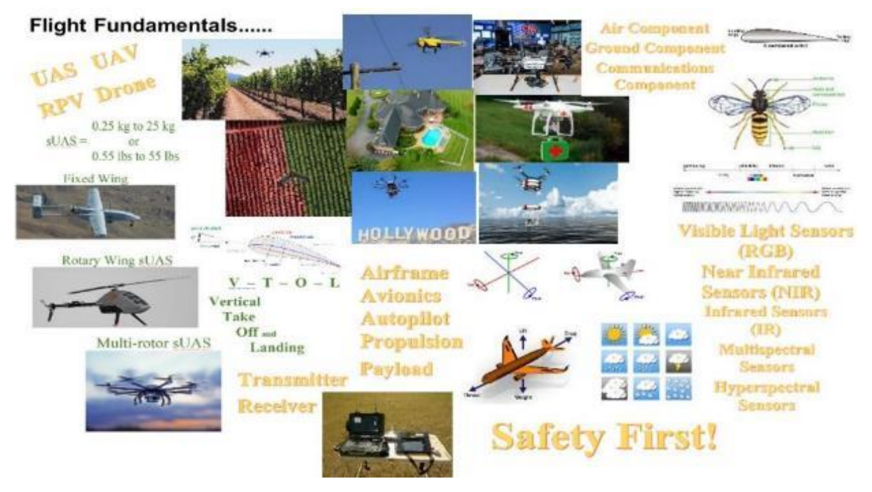
Figure 43. NMSU STEM activities provide a broad vision of UAS operations and the impact to society.