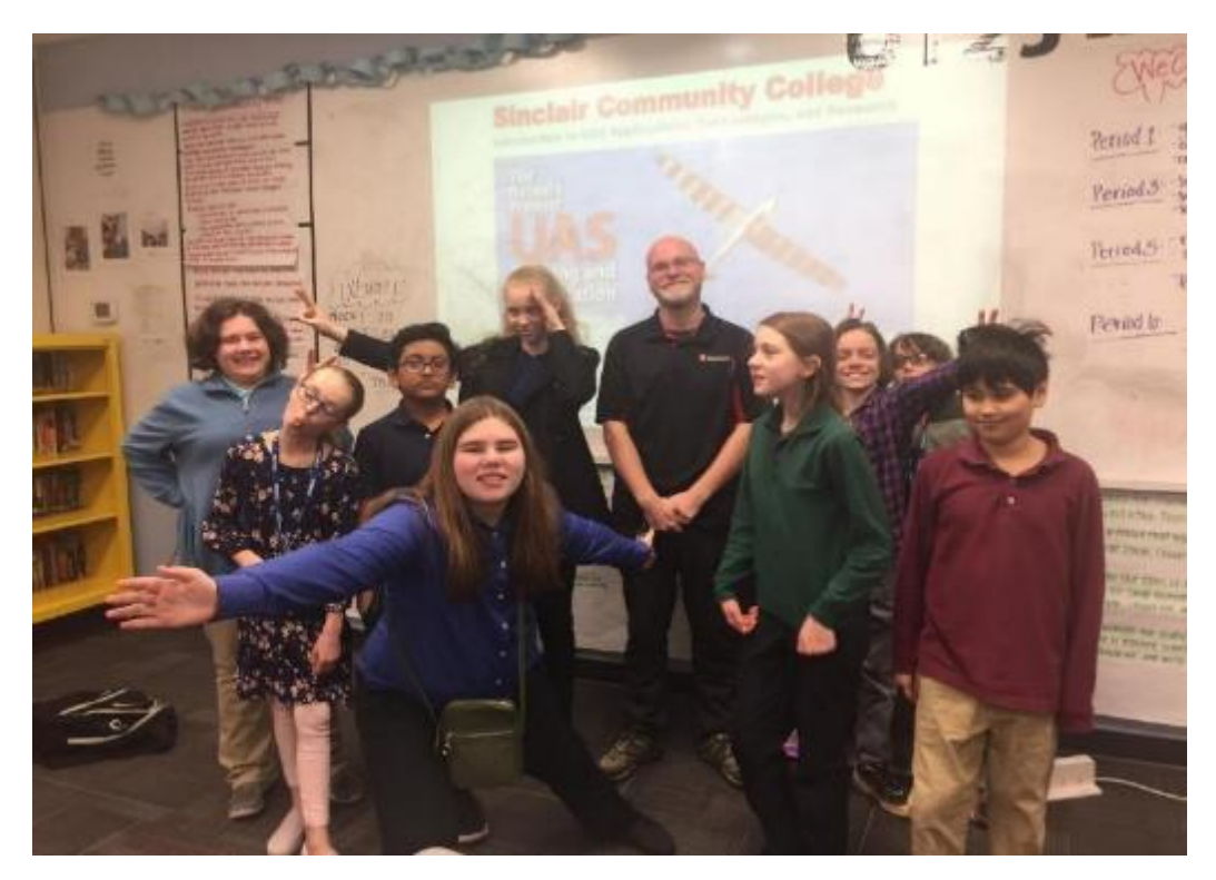
Figure 35. Middle School Students Following Outreach Event.