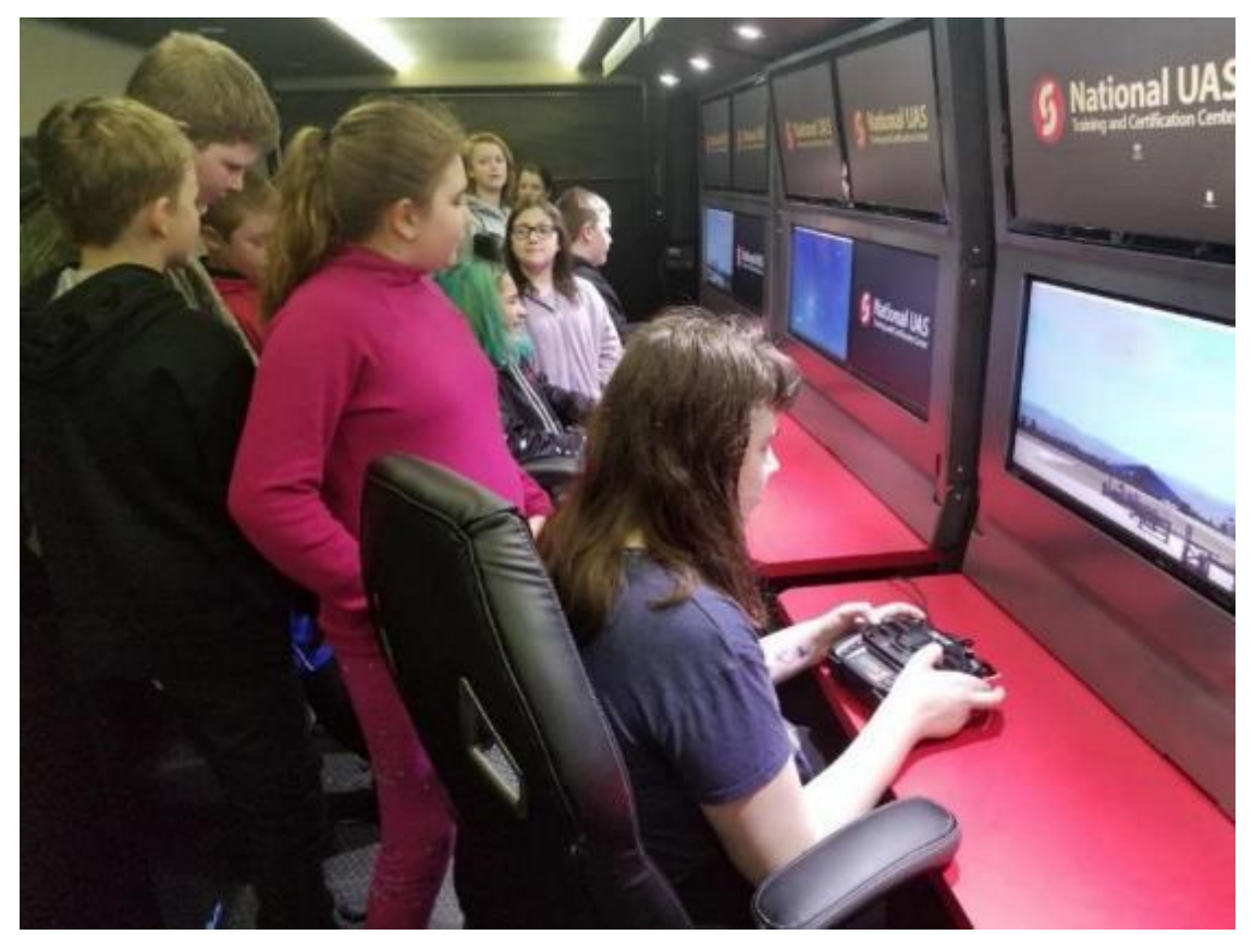
Figure 31. Middle School Students Flying UAS Simulators in the Sinclair Tactical Ground Control Station.