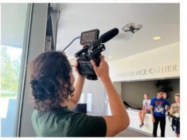
A student looks on through a camera looking at what the drone camera is aiming at.