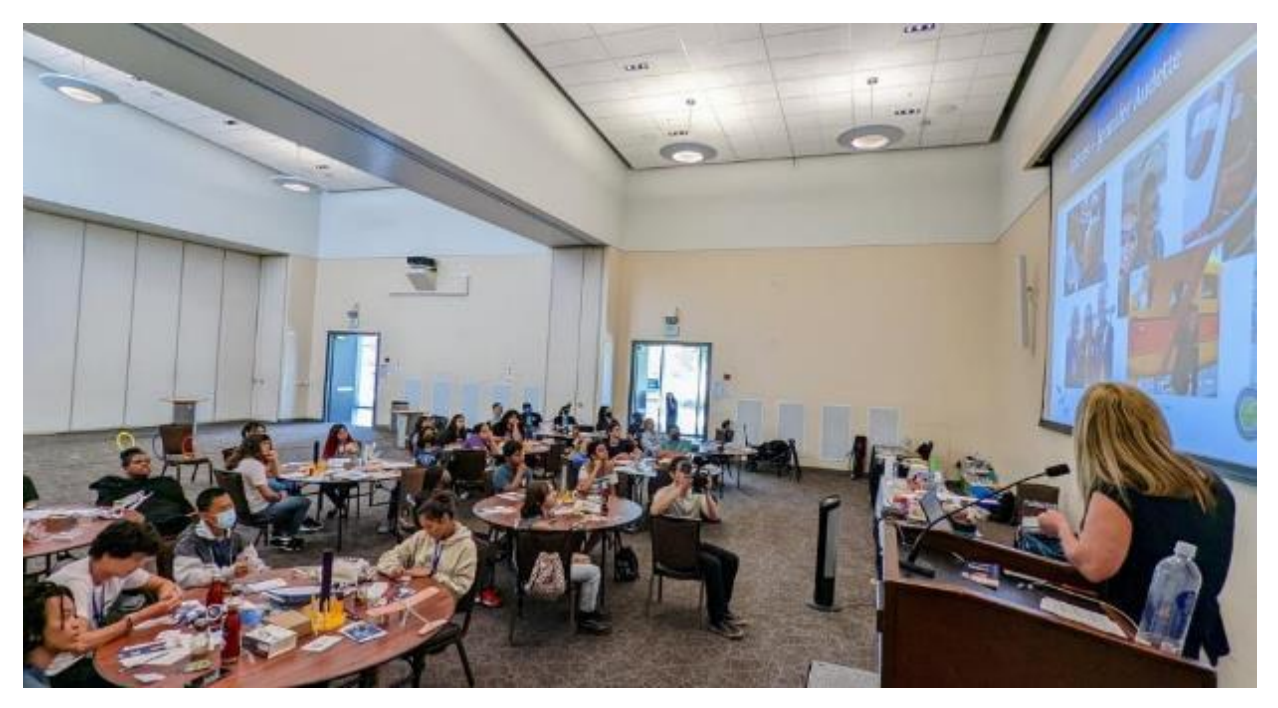
Figure 15. UCD 5th Summer ASSURE Drone Academy, July 27-30, 2022. The FAA Presents on Aerospace Careers to the Academy.