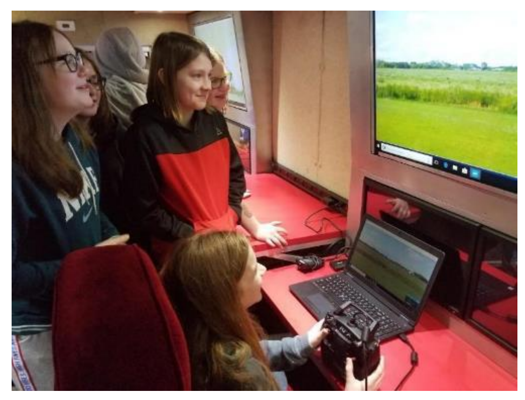
Figure 34. Middle School Students Flying UAS Simulators in the Sinclair Mobile Ground Control Station.