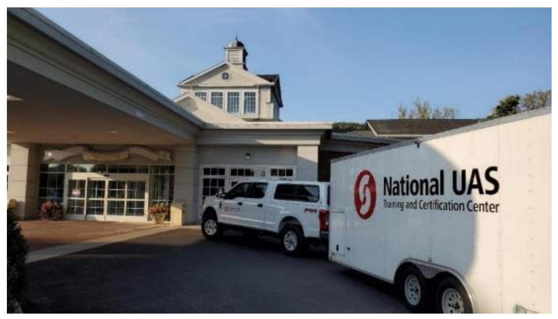
Figure 30. Sinclair Tactical Ground Control Station at Carillon Historical Park.