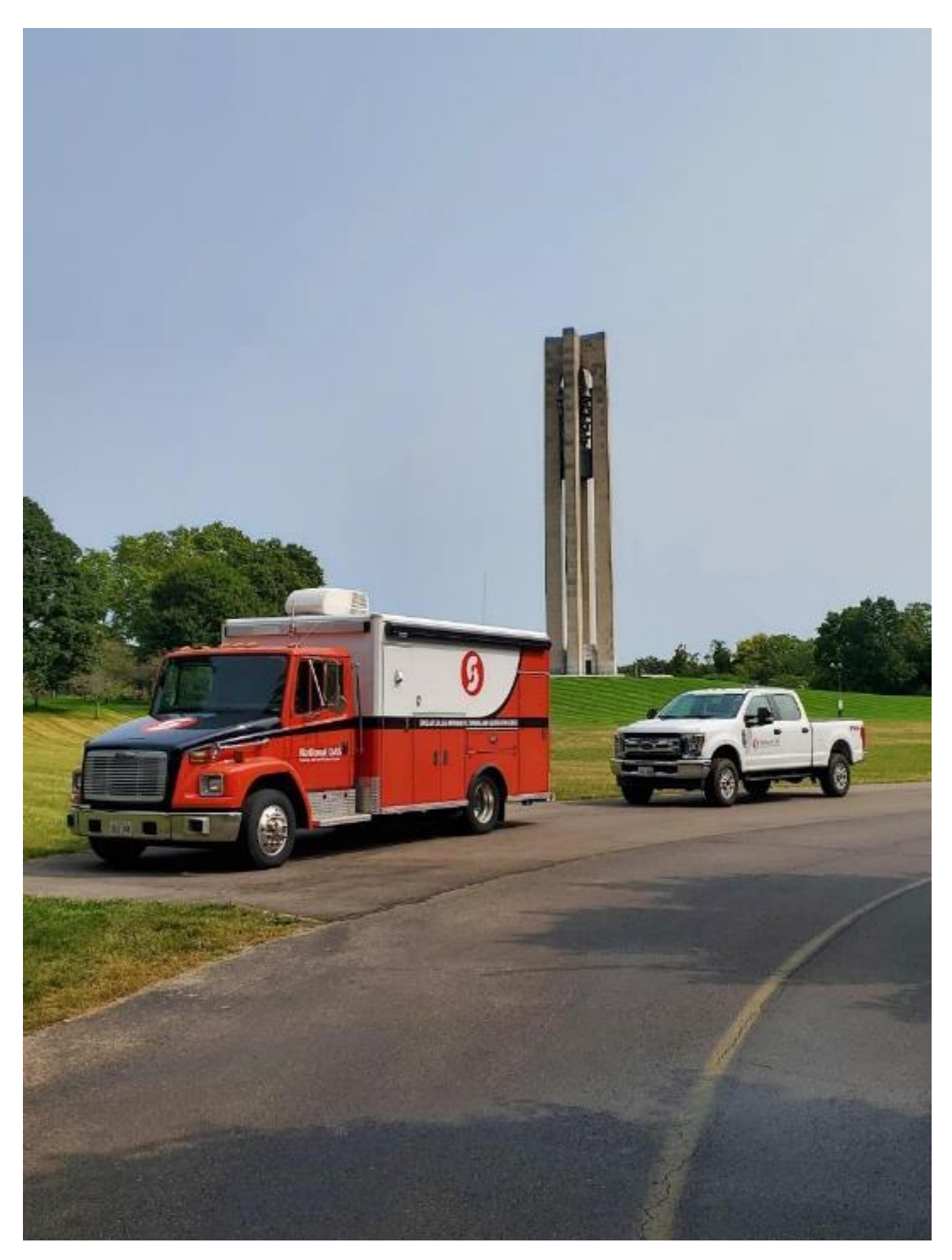
Figure 29. Sinclair Mobile Ground Control Station at Carillon Historical Park.