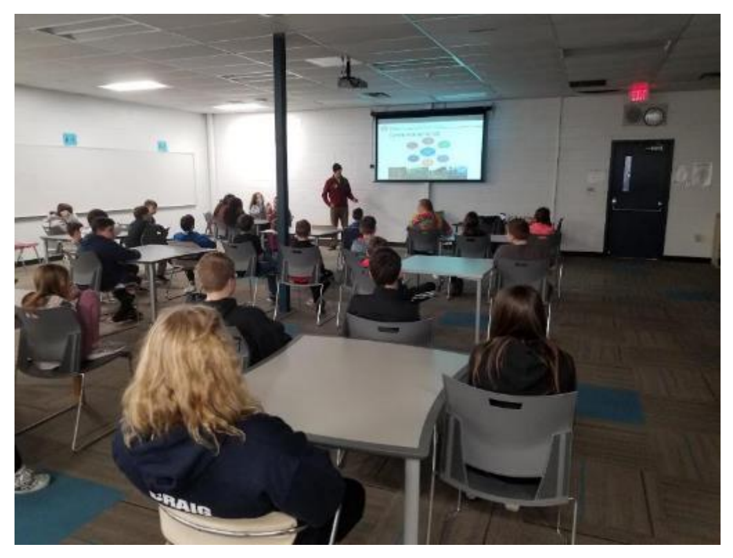
Figure 32. Middle School Students Listening to the Project Presentation.