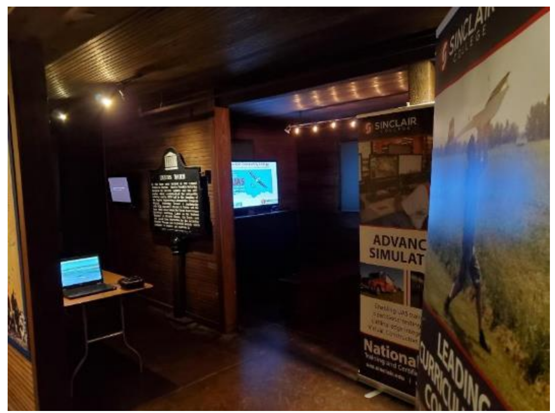
Figure 27. The Project Presentation and UAS Simulation Experience Setup at Carillon Historical Park.