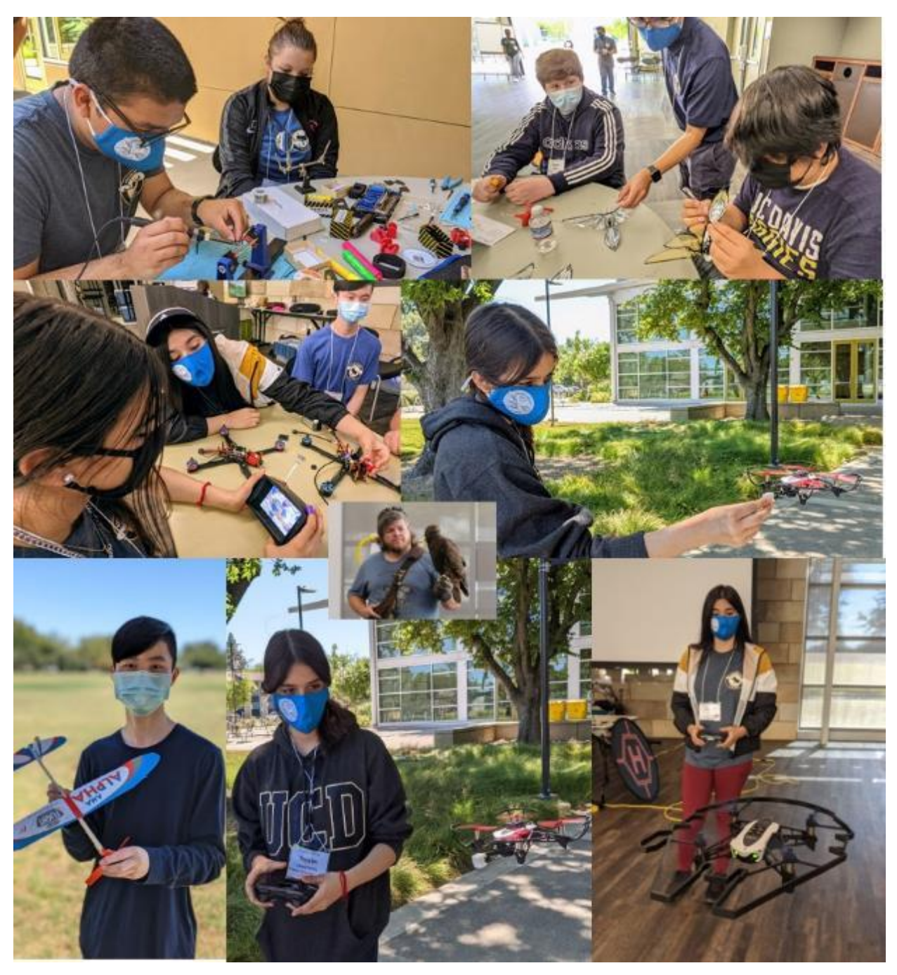
Figure 11. UCD August 9-13, 2021, Drone Academy.