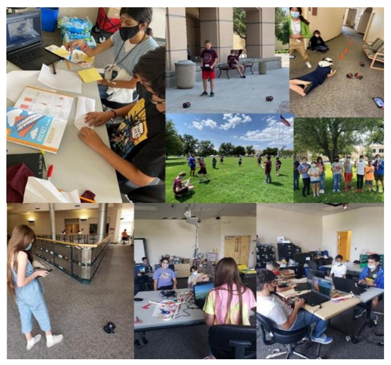
Figure 40. NMSU 2021 Drone Summer Camp activities.

The NM Flight Test Site STEM team supported the "Wings 'n Wheels Fest '21" seen in Figure 41 at the Las Cruces International Airport on September 25, 2021 (8 AM to 4 PM), with display and hands on activities. The NMSU team had an Aerostar and helicopter on display along with flight simulators and ground bots for hands on activities. Approximately 2,900 people attended the event (where many children come by to "play" and "fly"). There was a B-25 on display and giving flights, 34 airplanes on display at the show, 59 show cars, 4 motorcycles, 6 big trucks, and one jet boat too!