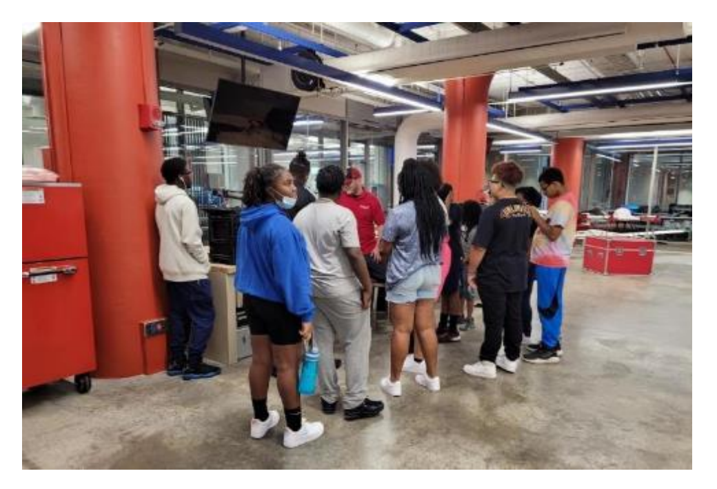
Figure 33. Dayton Early College Academy Students Receiving UAS Design Briefing.