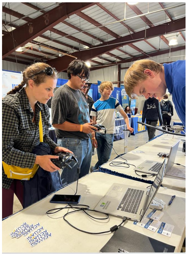
Figure 9. Kids using the flight simulator at the Tanana Valley State Fair.

August 28-31, 2022 - UAF personnel conducted STEM outreach in Valdez as a part of a UAF initiative to develop drone curricula for middle-school students.