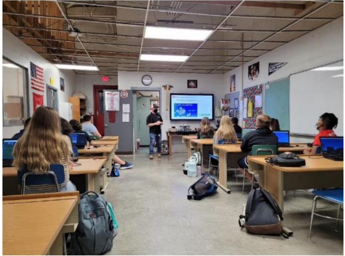
Figure 25. Middle School Students Listening to the Project UAS Careers, Applications, Technologies, and Research Presentation.