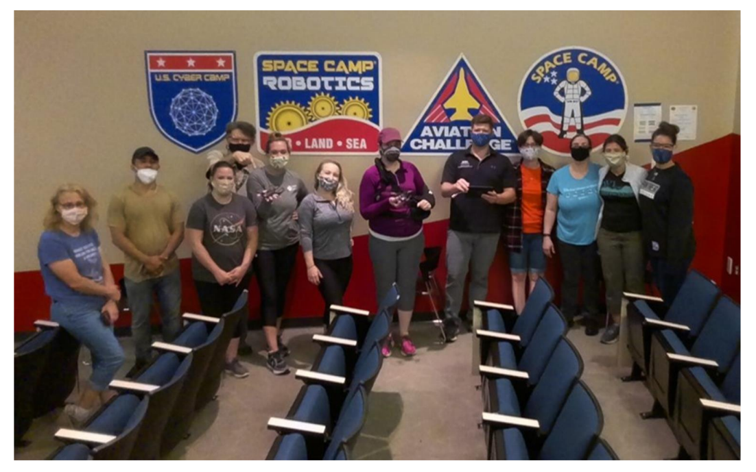
Figure 4. The Alabama Teachers Session in 2021 had 25 educators in two groups from across all of Alabama attend Space Camp for Educators.

AUSOME was the significance placed on the demonstrations with Space Camp for Educators which quickly became a staple of the program and a favorite amongst the attending teachers.