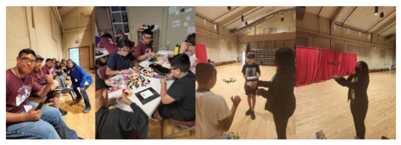
Figure 42. NMSU 2022 STEM Summer Camps.