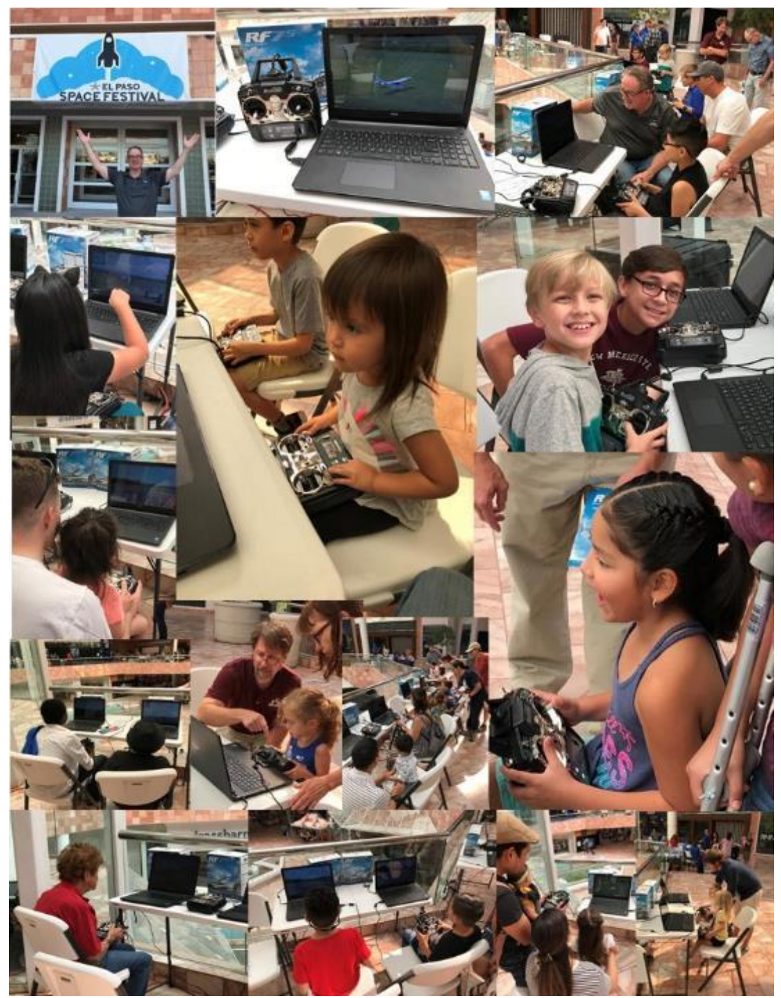
Figure 37. The El Paso Space Festival provided hands on flight simulator time for students and families.