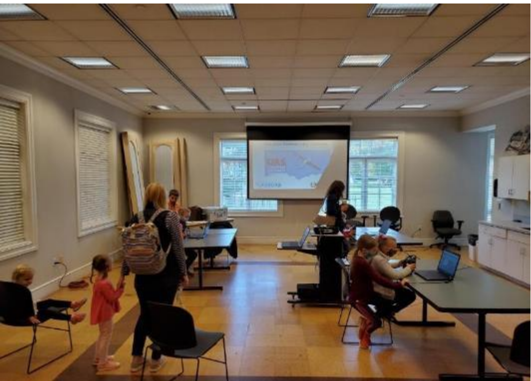
Figure 28. Project Presentation and UAS Simulation Experience Setup at Carillon Historical Park.