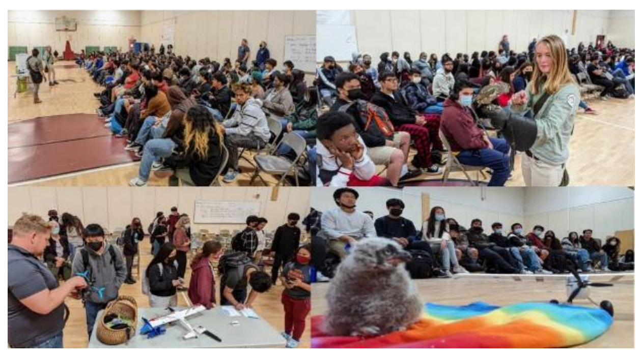
Figure 13. UCD Florin High School, Sacramento, May 13, 2022.