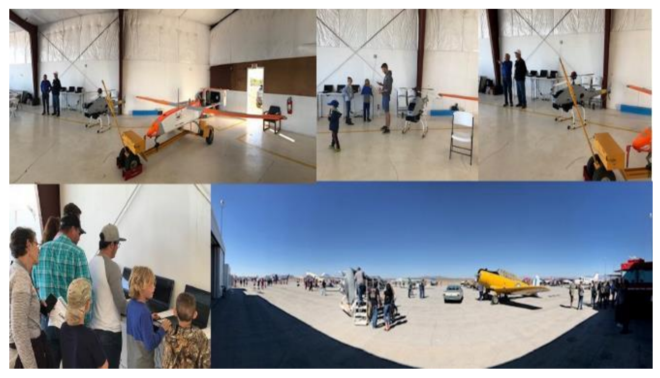
Figure 38.The Las Cruces "Fly In" at the Las Cruces International Airport was a hands-on demonstration of UAS, flight simulator fun, and discussions about the ASSURE COE UAS research.

As illustrated in Figure 38, the team also supported the October 19, 2019 "Fly In" at Las Cruces International Airport. During the April 2020 time frame, many of the outreach plans were stopped due to COVID-19. This is covered in another section of this report. During this time frame, a request from ASSURE was received to support a STEM Outreach Presentation. NMSU personnel filled in on a panel for the online "Drone Workforce Conference" on Wednesday morning June 10, 2020. Copies of the request and presentation materials were provided to the FAA. The presentation via Zoom highlighted at a top level the various approaches used for STEM under this grant.