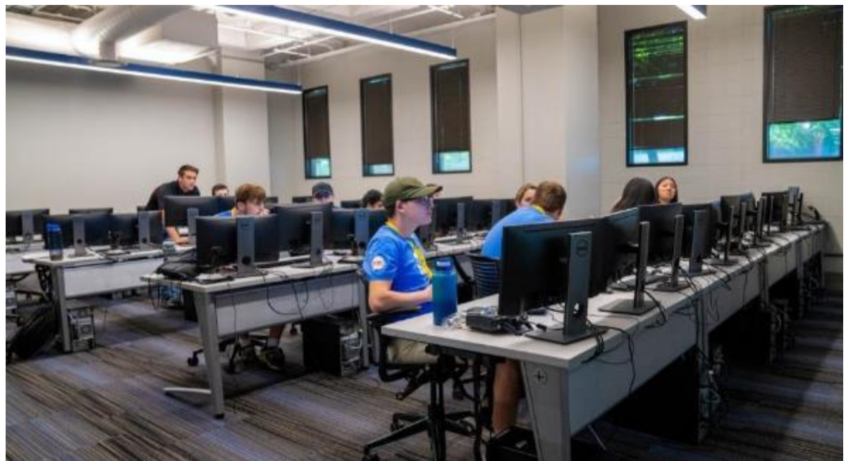
Figure 24. Air Camp High School Students Designing a UAS Sensor Mount for CNC and Additive Manufacturing.