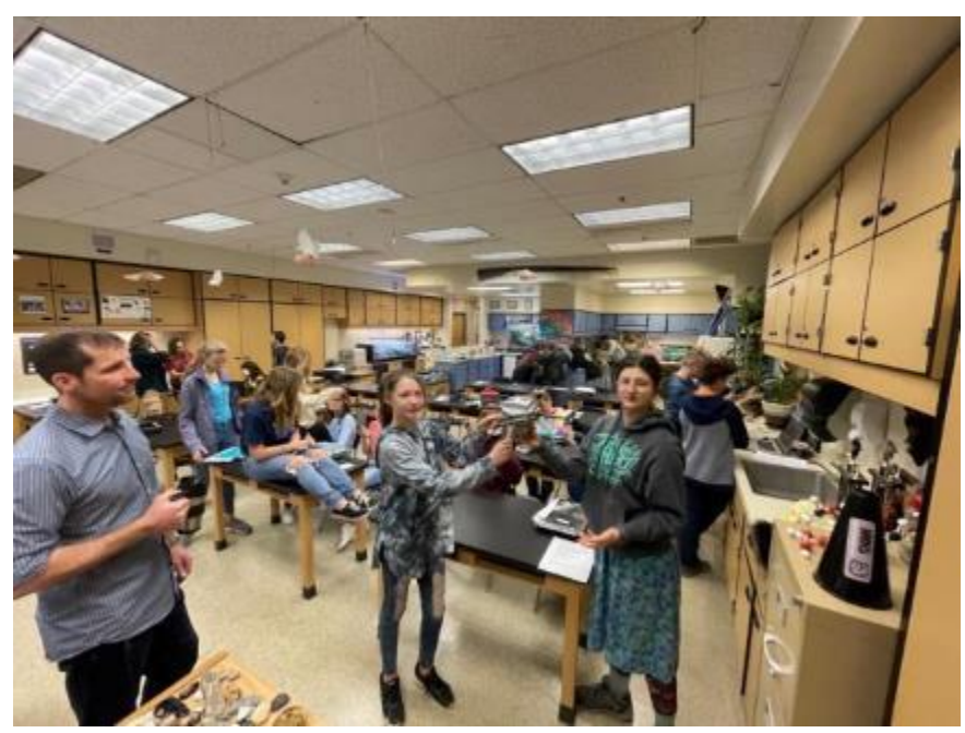
Figure 6. Students in Nikiski Middle/High School.

November 3-4, 2021 - The UAF team conducted an outreach at the Nikiski Middle/High School. There were 3 classes of 15-20 kids each (6-8 grade). The contact has requested UAF work with them to improve their drone programs. UAF has provided parts lists and information on drones they build with our summer camp participants.