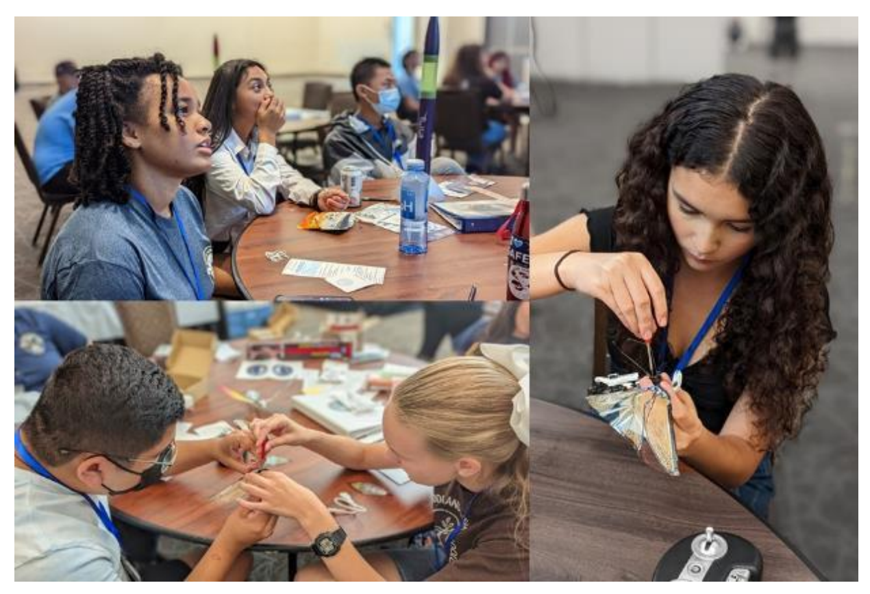
Figure 16. UCD 5th Summer ASSURE Drone Academy activities.